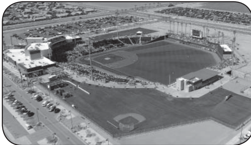
GOODYEAR BALLPARK - GOODYEAR, ARIZONA